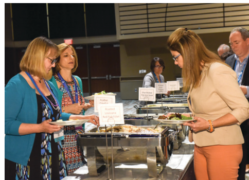
IOMSN members feasted on a variety of New Orleans specialties, some straight from the bayou.

With next year's Annual Meeting to be held in Nashville, TN, IOMSN leaders promised an equally festive event to mark the Organization's 21st birthday, albeit with cowboy hats instead of Mardi Gras masks, and the sounds of Zydeco giving way to the strains of good-ole country music. 🌎