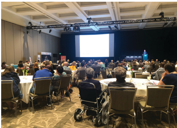
A ballroom at the Washington State Convention Center was filled on Friday afternoon, May 31 st , with patients and their families and caregivers for the "More About MS" educational forum for people living with MS.

More About MS, a 1-day educational forum and luncheon for people living with and affected by MS, was held on Friday, May 31 st , 2019, in conjunction with the CMSC Annual Meeting. The program took place in a ballroom at the Wash-