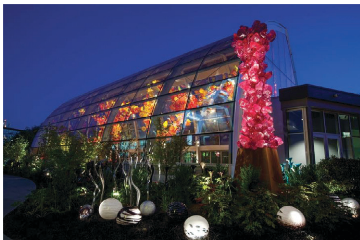
Located right next to the Space Needle, Chihuly Garden and Glass, featuring indoor and outdoor installations of the famed glass artist Dale Chihuly, a Washington State native, was one of the highlights of Seattle.